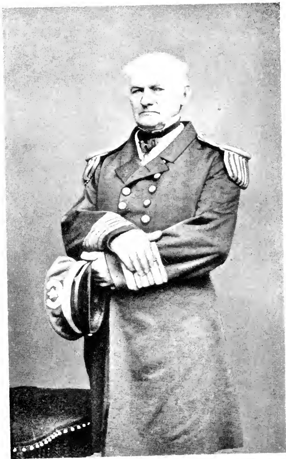
HIRAM PAULDING Rear-Admiral, U. S. N. About 1863